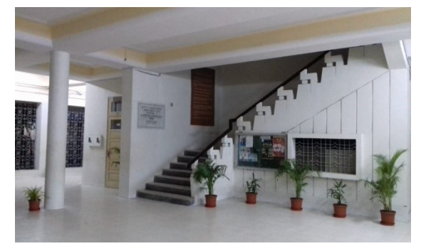
Before After Front & back court yard