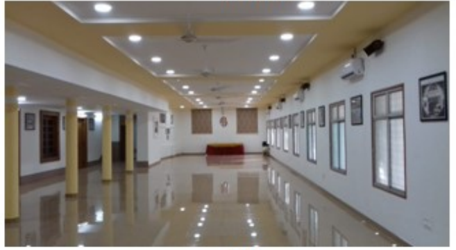
Before Dissection Hall